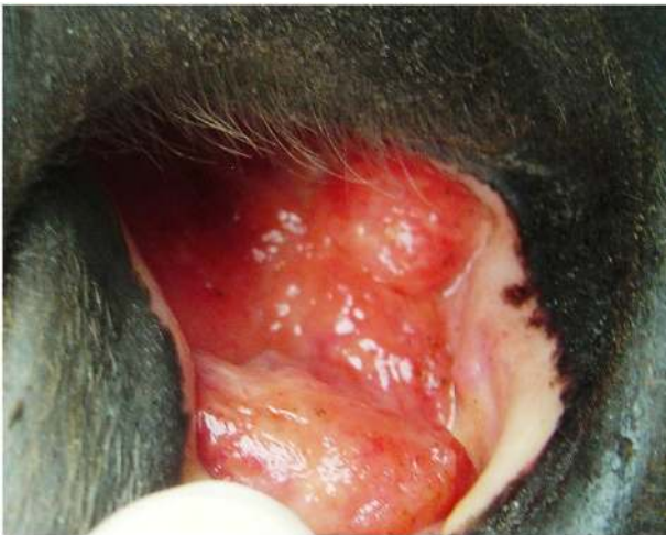
Figure 1. Mass with multinodular, smooth, shiny and reddish, non-ulcerated surface in the nasal mucosa of a Quarter horse.

the municipality of Itaporanga in the State of Paraíba was admitted at the Veterinary Hospital after recurrent episodes of epistaxis one year long. The animal has been used for vaquejada, a sport of Northeastern Brazil, which consists in knocking a bovine over by pulling its tail. Clinically the animal showed inspiratory dyspnea with dilated nostrils, difficult respiration, and intolerance to exercise. The respiratory rate during resting was 32 movements per minute. An irregular bilateral mass with multinodular, smooth, shiny and reddish, non-ulcerated surface, and firm and elastic consistency was detected in the mucosa of the rostral nasal cavity (Figure 1), causing partial stenosis of the anterior airways. After bilateral infraorbital nerves block with 10 mL of 2% lidocaine per foramen, much of the mass was surgically removed to improve the respiratory condition of the animal. Samples of the mass were fixed in 10% buffered formalin, embedded in paraffin, sectioned at 4-6 µm, and stained with hematoxylin and eosin. Selected sections were also stained with Congo red and observed under polarized light. Other samples were cultivated in agar agar and 2% Sabouraud agar and incubated at 30°C during 24 to 96 hours.