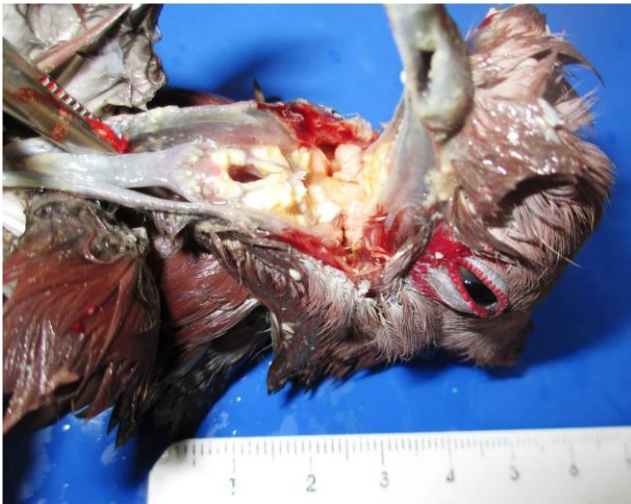
Figure 1. Rock Pigeon ( Columba livia ) exhibiting a focally extensive mass in the oral cavity.

An adult, male Rock Pigeon ( Columba livia ) exhibiting signs of weakness and recumbence was found by a pedestrian in a city square and was referred to the Veterinary Hospital at Universidade Estadual Paulista (UNESP) in Araçatuba. The animal was in poor body condition and died during physical examination shortly after arrival at the hospital. At necropsy, a focally extensive, 2 cm in diameter, white-yellow mass with an irregularly roughened, friable surface and putrid odor was found on the mucosa of the hard palate and extending into the oropharynx (Figure 1). No significant gross lesions were found in any of the remaining organs