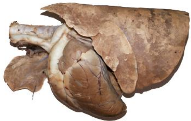
Figure 4. Left lateral view showing agenesis of the apical lobe after removing the replaced adipose tissue.