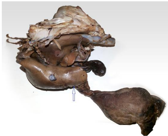
Figure 2. Visceral surface of the liver proper. Note to a severe concavity of this surface. The arrow indicates the umbilical fissure.