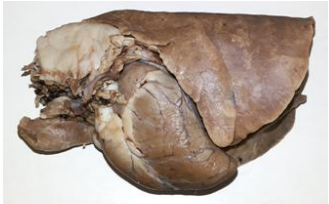
Figure 3. Lateral aspect of the left lung showing the replaced adipose tissue instead of the apical lobe.