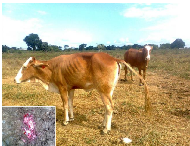
Figure 1. Bovine enzootic hematuria in Northeastern Brazil. (A) Bovine from outbreak A with progressive weight loss. In detail, hematuria.

which became keratinized as they approach the lumen; and Brunn's nests (1/26), formed by cells of transitional epithelium grouped into nests on the lamina propria, with or without connection to the epithelial surface. General changes seen in the lamina propria were: mild hemorrhages (13/26), myxoid stroma (11/26), characterized by multifocal areas of loose connective tissue associated small amounts of amorphous and slightly basophilic material, mild swollen of endothelial cells (4/26), and dilation of lymphatic vessels (2/26). The inflammatory changes consisted of lymphoid follicles (8/26) organized around small vessels and histiocytic and lymphoplasmacytic infiltrate (1/26).