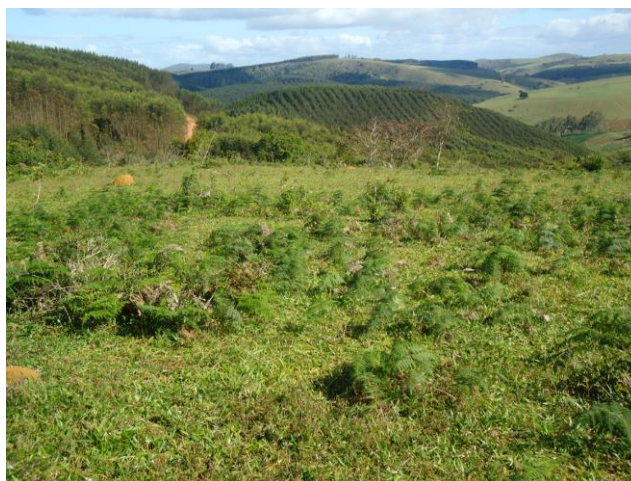
Figure 2. Bovine enzootic hematuria in Northeastern Brazil. Pasture at the property from Southwestern Bahia (outbreak A). Note moderate invasion by P. arachnoideum in the area where the cattle were kept.