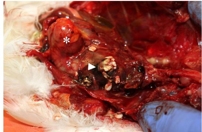
Figure 1. Gross Findings. Proventricular perforation and proventricular contents free in the coelomic cavity (arrowhead). An asterisk indicates the position of the ventriculus.

multifocal, subacute lymphoplasmacytic encephalitis (Fig. 3B). Additionally, there was a lymphoplasmacytic airsacculitis and parabronchial hemorrhage and presumed secondary to the coelomitis.