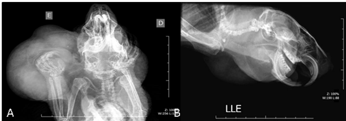
Figure 1. Swelling in soft tissues, measuring 7 cm x 9 cm with regular and well-demarcated borders, in the left side of the skull cap topographically related to salivary gland with no evidences of bone commitment. (A) Dorsoventral radiographic projection of the cranium. (B) Lateral radiographic projection of the cranium.

Based on the clinical examination and radiographic findings a neoplastic process was the main differential. Fine needle aspiration was performed, but there were no conclusive findings. Thus, surgical excision was performed, followed by histopathological examination.