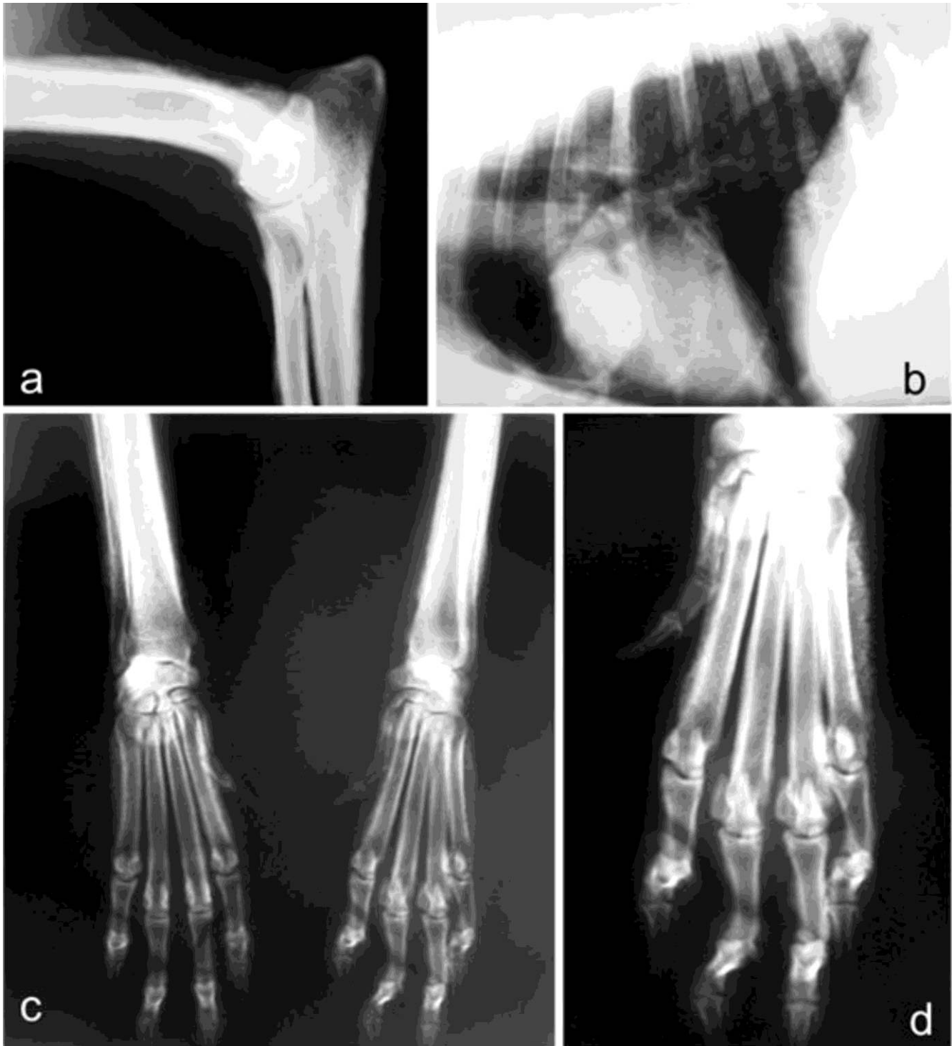
Figure 1. Pulmonary hypertrophic osteopathy. (a) Solid periosteal reaction, irregular and perpendicular to the cortex at the radius, ulna and distal caudal third of the humerus; (b) Thoracic radiography revealed a mass image located in the middle region and in relation to the right heart silhouette; (c-d) Solid periosteal reaction, irregular and perpendicular to the cortex at the first phalanx and metacarpal of the five finger.