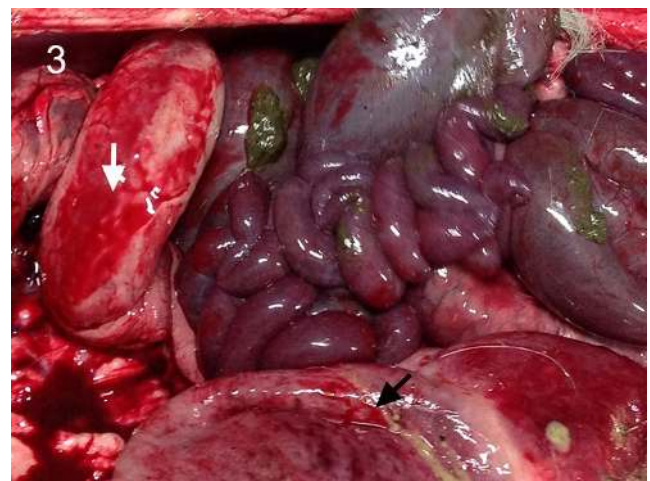
Figure 3. Severe serosal hemorrhages on intestine (white arrow) and forestomach (black arrow).