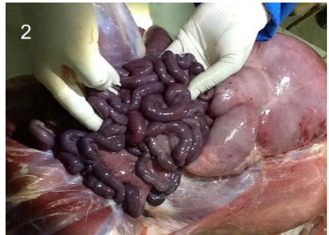
Figure 2. Diffuse dark discoloration of the intestinal serosa.

Laboratory (Pullman, WA) for in situ detection of BTV and EHDV antigens. After extraction of nucleic acids with Trizol from paraffin-embedded tissues, BTV and EHDV were investigated using a real-time PCR (RT-PCR) assay (15). Test results were positive for BTV and negative for EHDV.