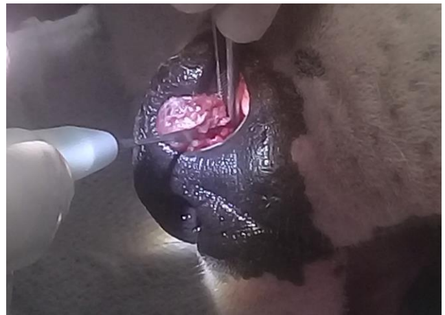
Figure 2. Recurrent rhinosporidiosis in the left nose of a dog, palliative surgical removal four months after first surgery.

Canine clinical rhinosporidiosis seems to be sex biased, as there are 20 known cases in male dogs and only 9 in females. A comparable situation was seen in human case series studies, which suggest males are more likely to