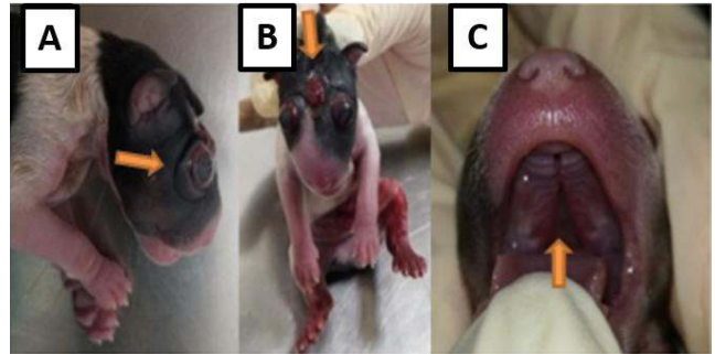
Figure 2. A. Proptosis. B. Incomplete closure of the frontal region. C. Cleft palate.

Pup 2: Cranial malformations, incomplete closure of the frontal region, microcephaly, proptosis and cleft palate (Fig. 2).