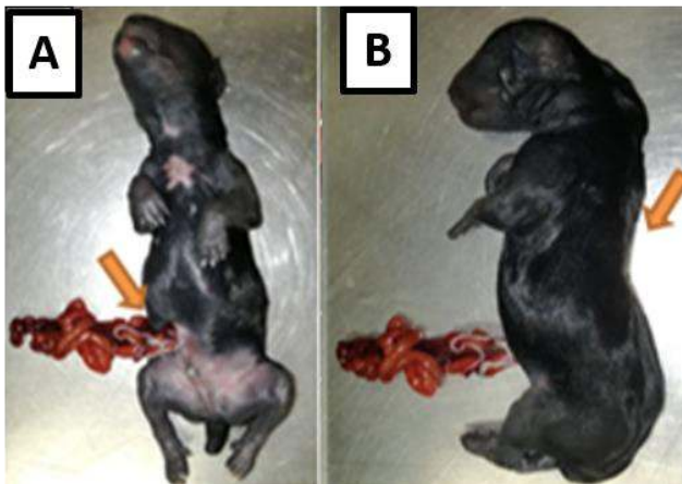
Figure 1. A. Evisceration. B. Scoliosis.

Pup 1: An incomplete closure of the linea alba , 1.5 x 1 cm of extension with evisceration, was observed on mesogastric region, specifically on the insertion of the umbilical cord. Posterior limbs presented (Fig. 1).