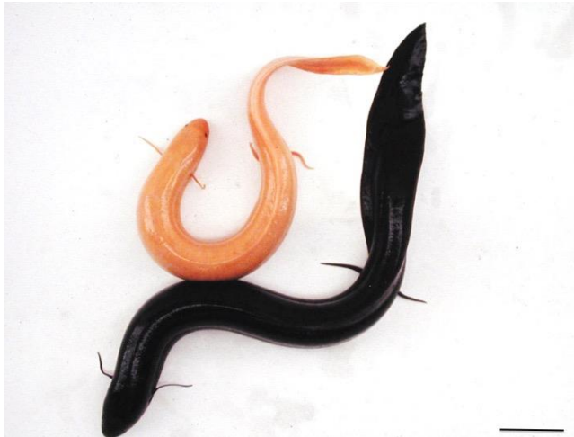
Figure 1. Two specimens of L. paradoxa , the superior with leucism and the inferior with normal pigmentation. Bar = 1.5 cm.

There are studies that suggest that the pigment anomalies in wild animals may be an indicator of various environmental situations as an effect of contaminants (3, 9). Since the pigment cells as the melanophores are derived from the neural crest (7, 11), it is possible that some kind of environmental stress, produced by contaminants such as heavy metals is capable of damaging the neural crest and change the distribution of melanophores (2, 5).