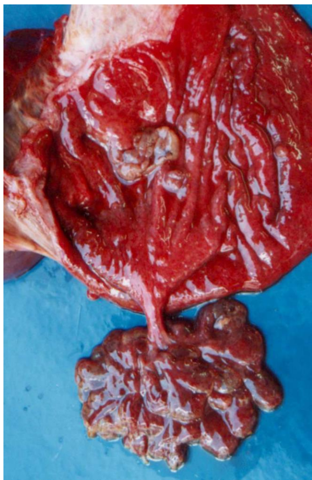
Figure 1. Gall Bladder, cow, HPB, female, seven years old. Pedunculated polypoid formation measuring 4.0 cm in its largest diameter was observed in the gallbladder's mucosa.

abomasal displacement to the left. Despite the attempt of surgical correction of such displacement, there was an unfavorable development culminating in its death 24 hours after the procedure. The animal was necropsied in the Laboratory of Animal Pathology of the Universidade Federal do Paraná. In the examination of the liver and gallbladder, a pedunculated polypoid formation measuring 4.0 cm in its largest diameter was observed in the gallbladder's mucosa, with a delicate base in the form of a rod measuring 2.5 cm in length (Fig. 1). The sample was collected and placed in 10% formalin for histopathological analysis. Microscopically, the lesion was characterized by a tubular configuration covered with a low cylindrical epithelium, which secreted mucus, with regular, vesicular nuclei with small and regular nucleoli. The stroma was represented by a delicate and loosened, vascularized connective tissue and edema (Fig. 2).