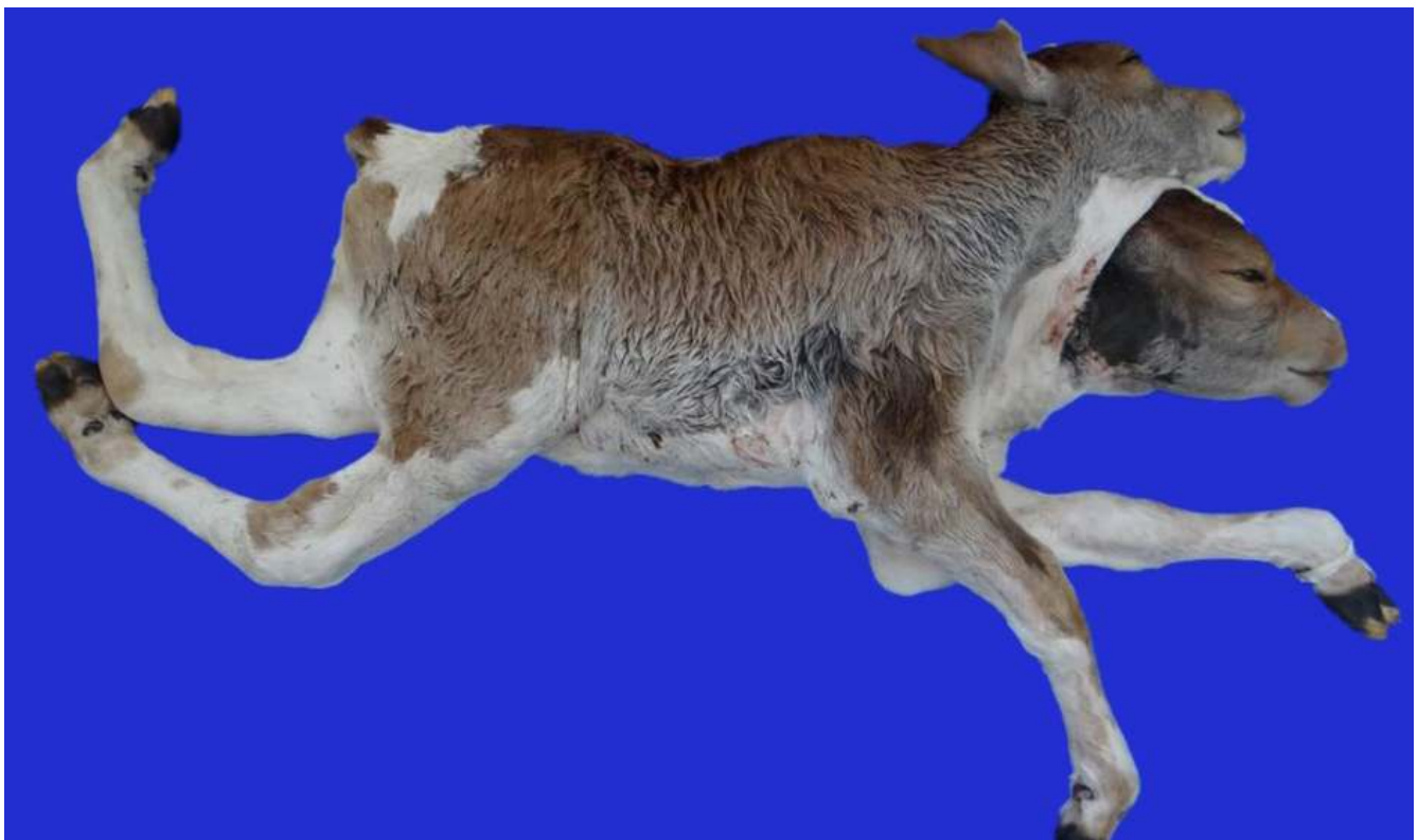
Figure 1. A stillborn complete dicephalus calf associated with arthrogryposis of the pelvic limbs.

A supernumerary rib was identified in-between the two thoracic columns in the ventrodorsal view, apparently articulated with the first left thoracic vertebra and cranially projected, towards the right neck. The spinous processes of the 3rd, 4th, and 5th left thoracic vertebrae were fused.