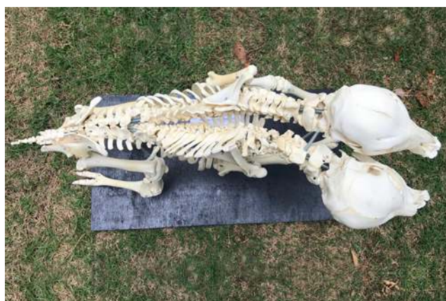
Figure 4. Dorsal view of the skeleton of the assembled double-headed calf. Duplication of the head, neck, cervical and thoracic spine with T13 - L1 fusion. Note that caudally at T13 there is only one lumbar, sacral, and caudal spine.

It is known that fetuses with congenital malformations, including dicephalus, often lead to dystocic births (22), since Siamese twins tend to be anatomically larger and disproportionate. The incompatibility between fetal size and the birth canal is the most common cause of bovine dystocia, and in most cases, surgical intervention is necessary, given the risk of death of the cow and fetus (3). It was reported in India the occurrence of dystocia of fetal origin, due to the large size of a stillborn Jersey bovine fetus, which had total duplication of the head and neck. Complications of this nature were not observed in the present case (8).