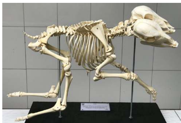
Figure 5. Two-headed bovine skeleton after maceration and assembly. Note two separate heads and two necks, a single rib cage, and marked arthrogryposis in the pelvic limbs.