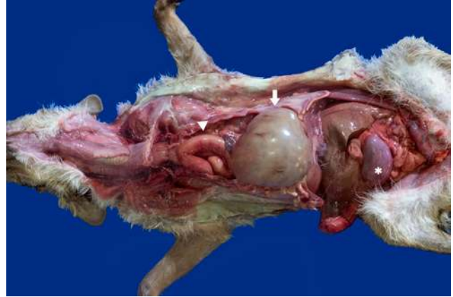
Figure 4. Diaphragmatic hernia and renal agenesis in a crab-eating fox ( Cerdocyon thous ). Note the gas-filled stomach (arrow) and intestinal loops (arrowhead) in the thoracic cavity. Only the right kidney (asterisk) was observed.