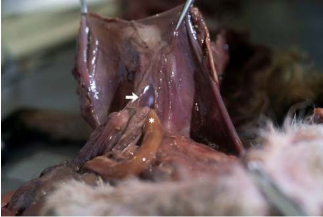
Figure 3. Diaphragmatic hernia in a crab-eating fox ( Cerdocyon thous ). Abdominal perspective. Note the intestinal loops (asterisk) projecting into the thoracic cavity through the diaphragmatic hernia. The hernia has smooth borders (arrow) and no signs of hemorrhage or lacerations are observed.