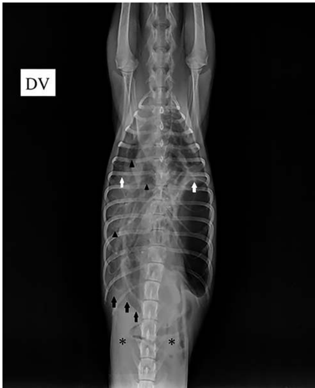
Figure 1. Dorsoventral projection of the thoracic radiography of the crab-eating fox. It is possible to observe an increase of radiopacity in the right hemithorax with visualization of interlobar fissures (white arrows) of the lung, suggestive of pleural effusion. Discontinuity in the musculature of the right diaphragmatic dome (black arrows), with passage of gas-filled opacities, compatible with the presence of intestinal loops (black arrowheads), almost complete absence of intestinal loops in the peritoneal cavity (asterisks).

The fox died during transportation on the second visit to the Veterinary Hospital, and the carcass was sent for necropsy at the Veterinary Pathology Laboratory at UFPB. At necropsy, the fox had adequate nutritional status and slightly pale ocular, oral and vaginal mucosa. A postero-lateral focal discontinuity of the dorsal aspect of the diaphragmatic muscle with protrusion of the gastrointestinal tract into the thoracic cavity (Fig.3) was observed. The stomach and intestinal loops were filled with gas and obliterated the visualization of the heart and lungs. The discontinuity was approximately 10 cm in diameter with smooth edges and no evidence of bleeding or fibrosis. There were multifocal to coalescing areas of atelectasis on the left lung, which was cranially dislocated and compressed by the stomach. Additionally, only the right kidney was found on an ectopic location near the urinary bladder, and no vestigial left kidney was identified (Fig.4). Although the ultrasound examination suggested hepatic congestion, on necropsy, the liver was pale brown and enlarged. There were no other remarkable abnormalities, and signs of polytrauma were absent.