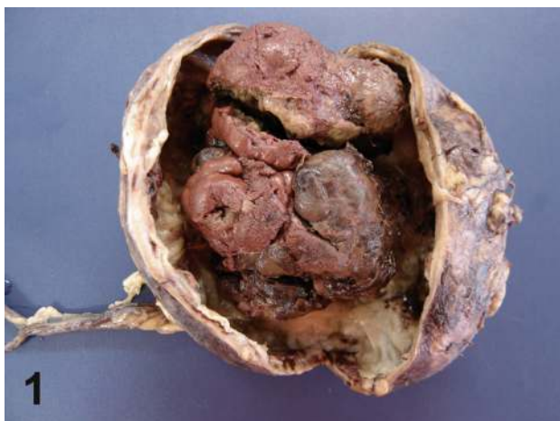
Figure 1 – Transitional cell carcinoma of the renal pelvis in a dog. Intense atrophy of the medullar and cortical regions with a dilated pelvis. In the pelvis, a solid mass is present with an 8 cm diameter and irregular border.