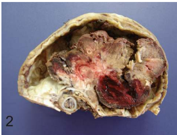
Figure 2 – Transitional cell carcinoma of the renal pelvis in a dog. The ureter is dilated and partially obstructed by a small fragment of neoplastic tissue from the renal pelvis.