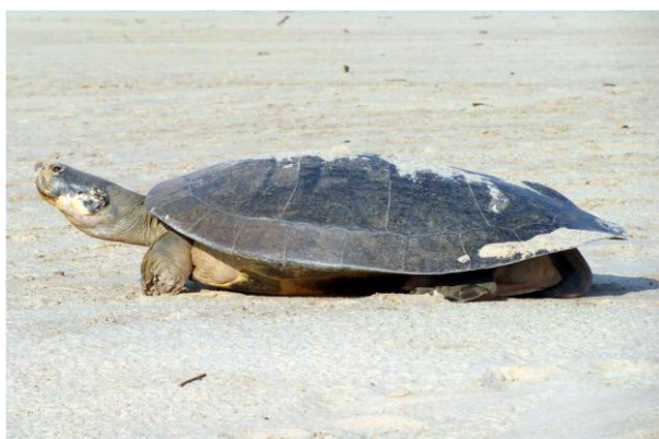
Figure 1: Podocnemis expansa adult female on a river sand bank in the environmental protection area of the Araguaia river. (Personal archive).

The genus Podocnemis , of the family Podocnemididae, is represented in South America by six species: P. expansa , P. erythrocephala , P. vogli , P. lewyana , P. unifilis and P. sextuberculata (4, 7). The species P. expansa (Fig. 1), known as the giant Amazon turtle, is largely distributed throughout the Amazon river and in most of its tributaries (3). The giant Amazon turtle is found in the states of Amapá, Pará, Amazonas, Rondônia, Acre, Roraima, Tocantins, Goiás and Mato Grosso, encompassing equatorial forests and savanna ( cerrado ) ecosystems in the north and west-central regions of Brazil (3). This reptile can measure from 75 to 107cm in length, 50 to 75cm in width and weigh up to 60kg (9), being the largest fresh water testudine in South America (2, 5, 8). They are long-lived animals with late sexual maturation and a low individual replacement rate (1, 6).