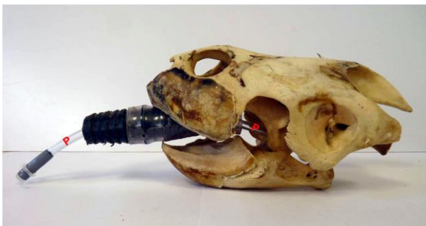
Figure 3: Probe introduction demonstration through the "mouth opener"; (P) Silicon flexible probe used in the stomach washing procedure in adult P. expansa . (Personal archive).

This method of collecting gastric contents was developed by our staff and has been successfully used in our research (Video 1).