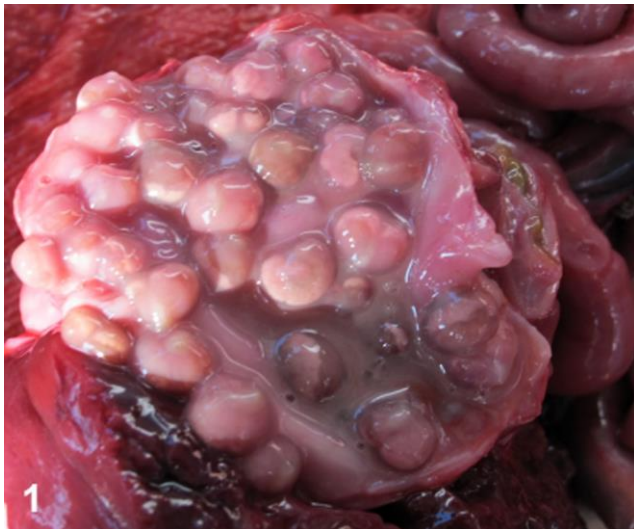
Figure 1. Embedded in the gastric mucosa of an adult female finless porpoise are myriad heart shaped digenean trematodes.

predominantly located in the pyloric stomach, the parasites also extended into the pylorus and obscured the ampulla of the duodenum. The trematodes presented as coalescing, botryoid masses of exophytic individual parasites (Fig. 1). The parasites were approximately 5-8 mm in diameter, heart shaped and pale brown with a white dividing line. These were attached to the gastric mucosa by a short stalk while the bulk of the parasite was free within the gastric lumen.