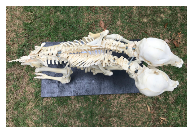
Figure 4. Dorsal view of the skeleton of the assembled doubleheaded calf. Duplication of the head, neck, cervical and thoracic spine with T13 - L1 fusion. Note that caudally at T13 there is only one lumbar, sacral, and caudal spine.

It is known that fetuses with congenital malformations, including dicephalus, often lead to dystocic births (22), since Siamese twins tend to be anatomically larger and disproportionate. The incompatibility between fetal size and the birth canal is the most common cause of bovine dystocia, and in most cases, surgical intervention is necessary, given the risk of death of the cow and fetus (3). It was reported in India the occurrence of dystocia of fetal origin, due to the large size of a stillborn Jersey bovine fetus, which had total duplication of the head and neck. Complications of this nature were not observed in the present case (8).