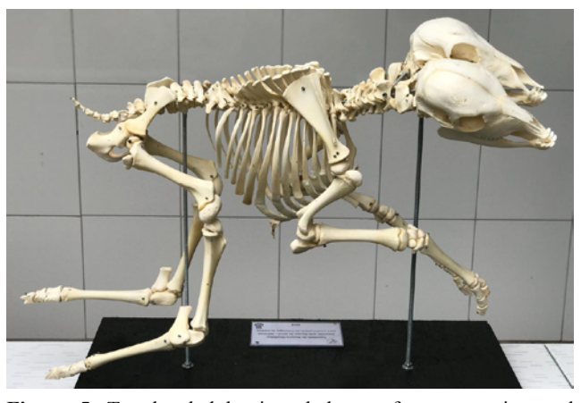
Figure 5. Two-headed bovine skeleton after maceration and assembly. Note two separate heads and two necks, a single rib cage, and marked arthrogryposis in the pelvic limbs.