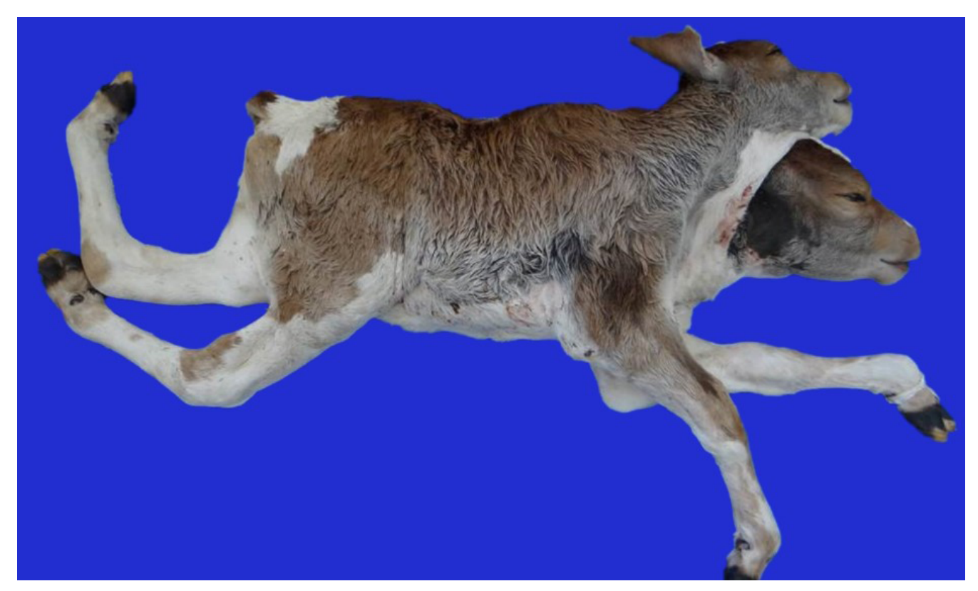
Figure 1. A stillborn complete dicephalus calf associated with arthrogryposis of the pelvic limbs.

A supernumerary rib was identified in-between the two thoracic columns in the ventrodorsal view, apparently articulated with the first left thoracic vertebra and cranially projected, towards the right neck. The spinous processes of the 3rd, 4th, and 5th left thoracic vertebrae were fused.